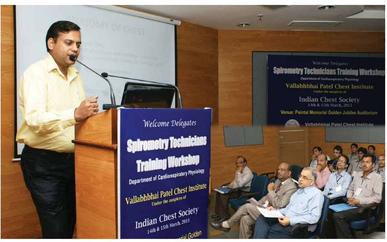
A Spirometry Technicians Training Workshop was organised at the Institute by the Department of Cardio - respiratory Physiology from 14 - 15 March 2013